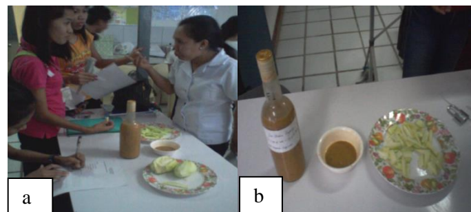
Figure 2. a. Sea urchin bagoong after 2 months of fermentation; b. Interview with respondents for validation and feedback.

Score card following the Five-Point Hedonic Scale was used to determine the acceptability of the various formulations. The following arbitrary weights with the corresponding values descriptive values were 5-Extremely Acceptable; 4-Highly Acceptable; 3-Moderately Acceptable; 2-Fairly Acceptable and 1-Not Acceptable.